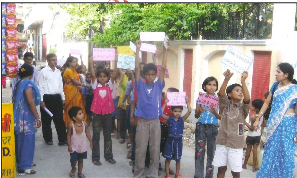
One of the rallies for Education Awareness in Indira Camp