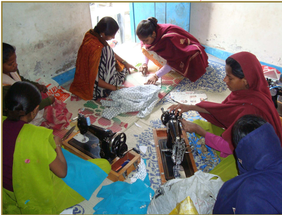
Women undergoing tailoring training at Sudamapuri