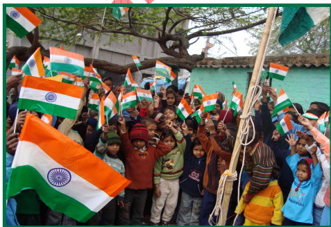
Children of Indira Camp celebrating Independence Day