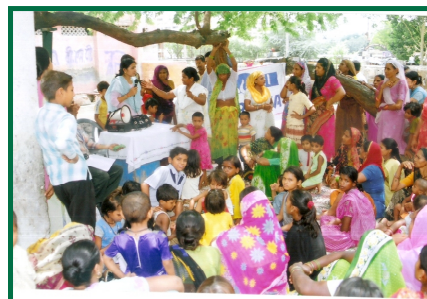
Community meeting at Indira Camp in Progress