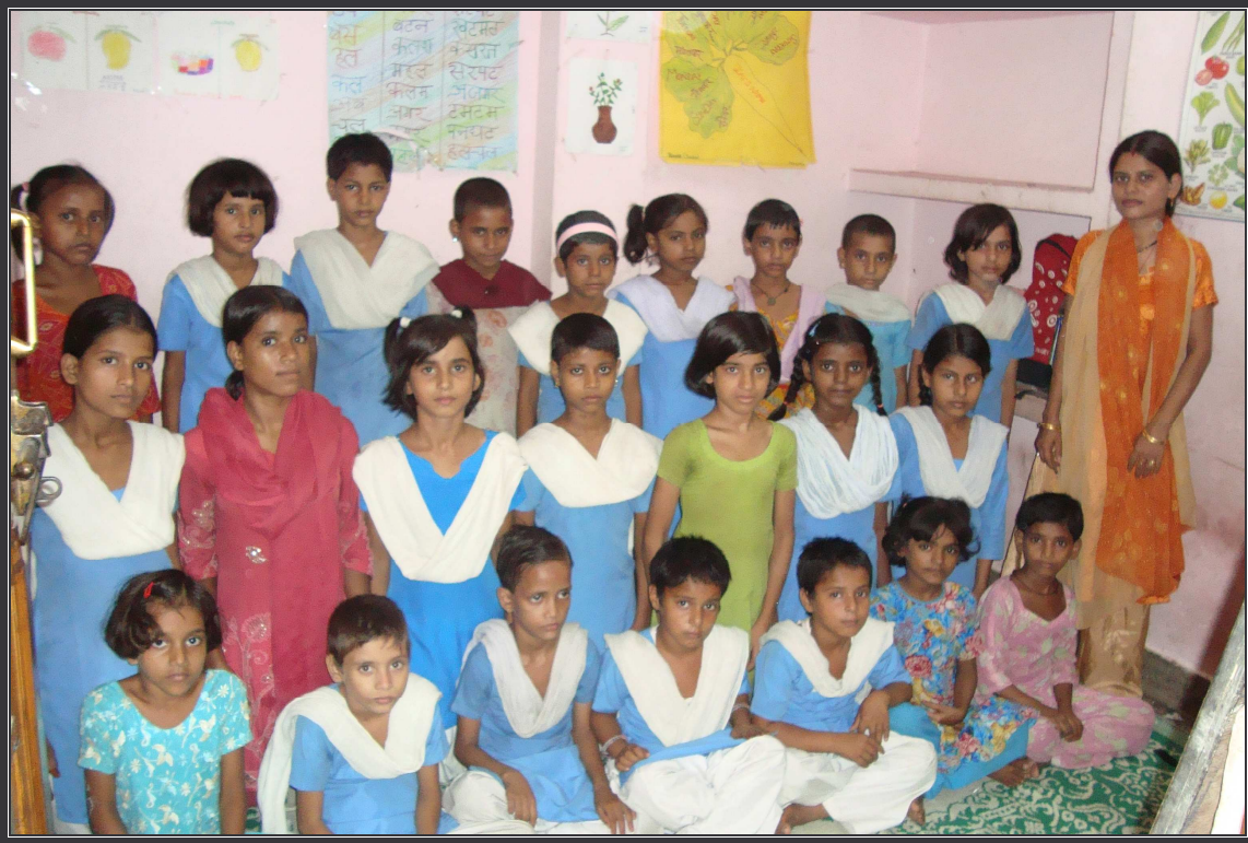
Children of Remedial Education Centre at Khora Colony