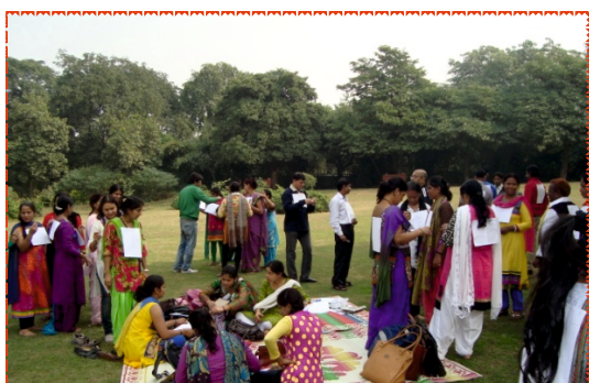
Training for RASTA Staff by Cargill HR Director