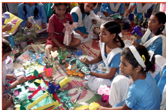
Teaching Learning Materials making in progress at Khora Colony School

Education, the raison d'être of Rasta, continues to be its core competence and intervention. It encompasses Pre-School, Formal, Remedial and Distance and Adult