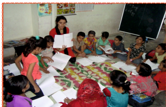
Training on how to use TLM, based on the book authored by the RASTA CEO, at the Pre-School at Indira Khureji Khas.