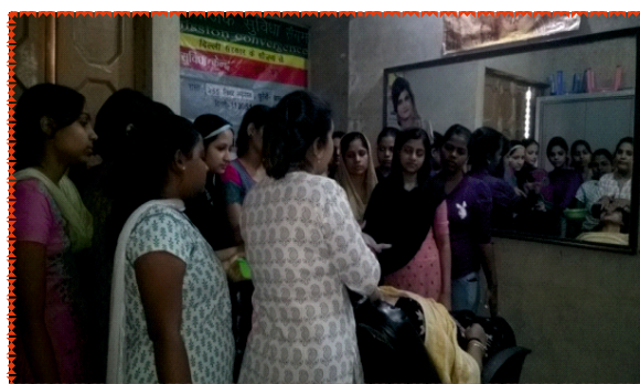
Demonstration in Beauty Culture Class at Khureji Khas

taken a room on rent at Indirapuram Market and have opened a Tailoring Shop. Each of them is earning about Rs 3,000 to Rs 6,000 per month.