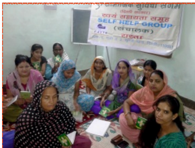
Meeting of SHG at East Laxmi Market

linking with Delhi Government's Anna Shree Programme, legal literacy, loans for small business ventures, etc., were carried out in 2013-14 benefiting about 6000 women