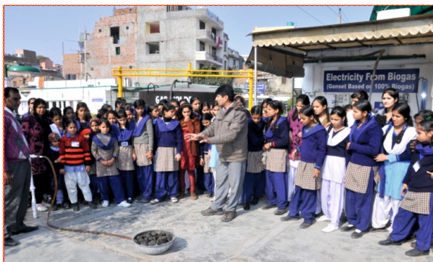
RASTA students on a Study Tour to Sulabh International, South West Delhi