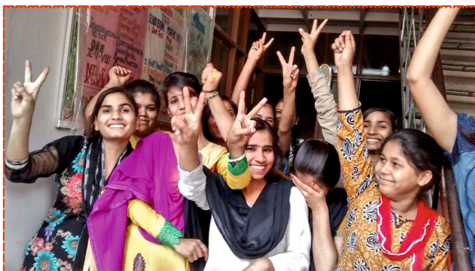
1st batch of 15 ‘out of school girls’ passed Class X in 2013-14;

Educated more than 19,000 children Mainstreamed 7000 children; 10 Non Formal Education Centers have evolved virtually into a Formal School, with 450 female students; Rasta has been awarded Appreciation Certificate by the Secretary, Education Deptt, Govt of Delhi; Accredited by National Institute of Open Schooling (NIOS) and Open Basic Examination (OBE); Assessed and rated as credible and effective by the “Credibility Alliance” a national network of NGOs, functioning as a watchdog of NGOs’ credibility; Conducted 5 research studies for UNICEF, Room to Read and Save the Children; Developed Teaching- Learning Material (TLM) in three subjects Hindi, English and Math’s for class 1 to 3; Empanelled by National CSR Hub; Established RASTA as an Organization dedicated to girl child education and women empowerment; Impacting the lives of two lakhs of people at 65 locations in 3 States.