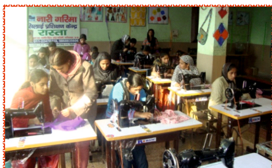
Tailoring Class at in progress at Khora

taken a room on rent at Indirapuram Market and have opened a Tailoring Shop. Each of them is earning about Rs 3,000 to Rs 6,000 per month.