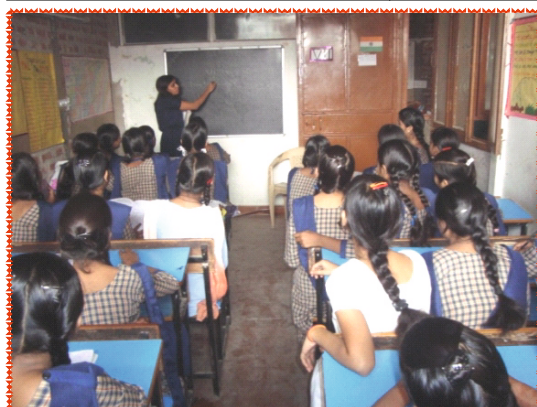
A Class in progress at Khora School