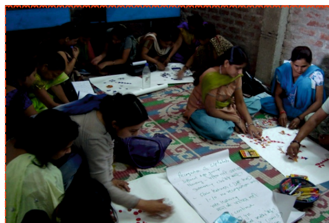
Teachers' Training in progress

Conducted 5 Training Programmes for Teachers Developed 17 types of Teaching-Learning Materials.