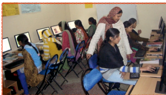
Computer Class at Vinod Nagar in progress

Given the socio-economic background of the target group, most of the students would look for some job to earn and supplement their parents' income. This fact prompted Rasta to conduct Vocational Training Programmes and impart job-oriented skills. In 2013-14, about 900 youth got skilled through courses like 'English for Employability', 'Retail Management', 'Personality Development', 'Basic Management', 'Tailoring', 'Beauty Culture', 'Computer Skills' etc. About 300 of those who passed out are employed, 5 of the trained women have