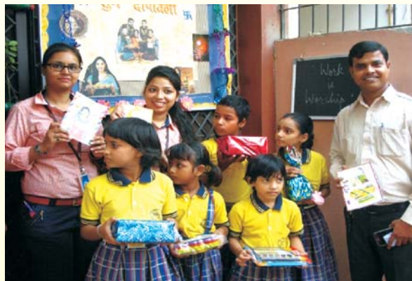
Visitor's from Big Bazar came to celebrate Diwali with the children at Rasta School, Indirapuram