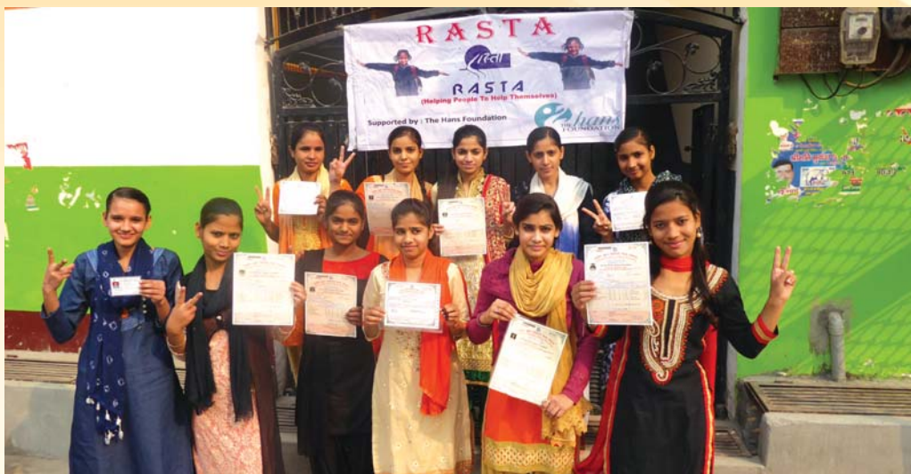
10th Standard Achievers for year 2016-17

"A DREAM BECOMES A GOAL WHEN ACTION IS TAKEN TOWARD IT'S ACHIEVEMENT"